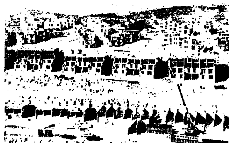
This partial view of construction at Immanuel clearly shows (from bottom to top) the increasing stages of readiness of flats.

The other purpose of the New York office is to attract investors who will build science-based industries in Immanuel. Progress has been made in this, the company representatives said, but details must wait until the deals are closed.